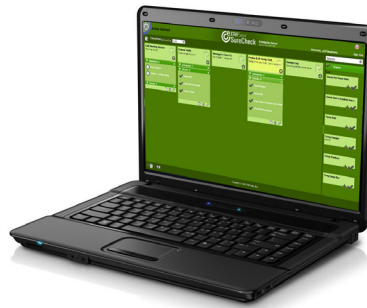
Web-Based Application Management